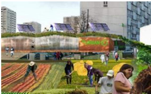
Atelier d'architecture autogérée www.rurban.net

Professor of Architecture and Design Activism, Head of Research, Sheffield School of Architecture